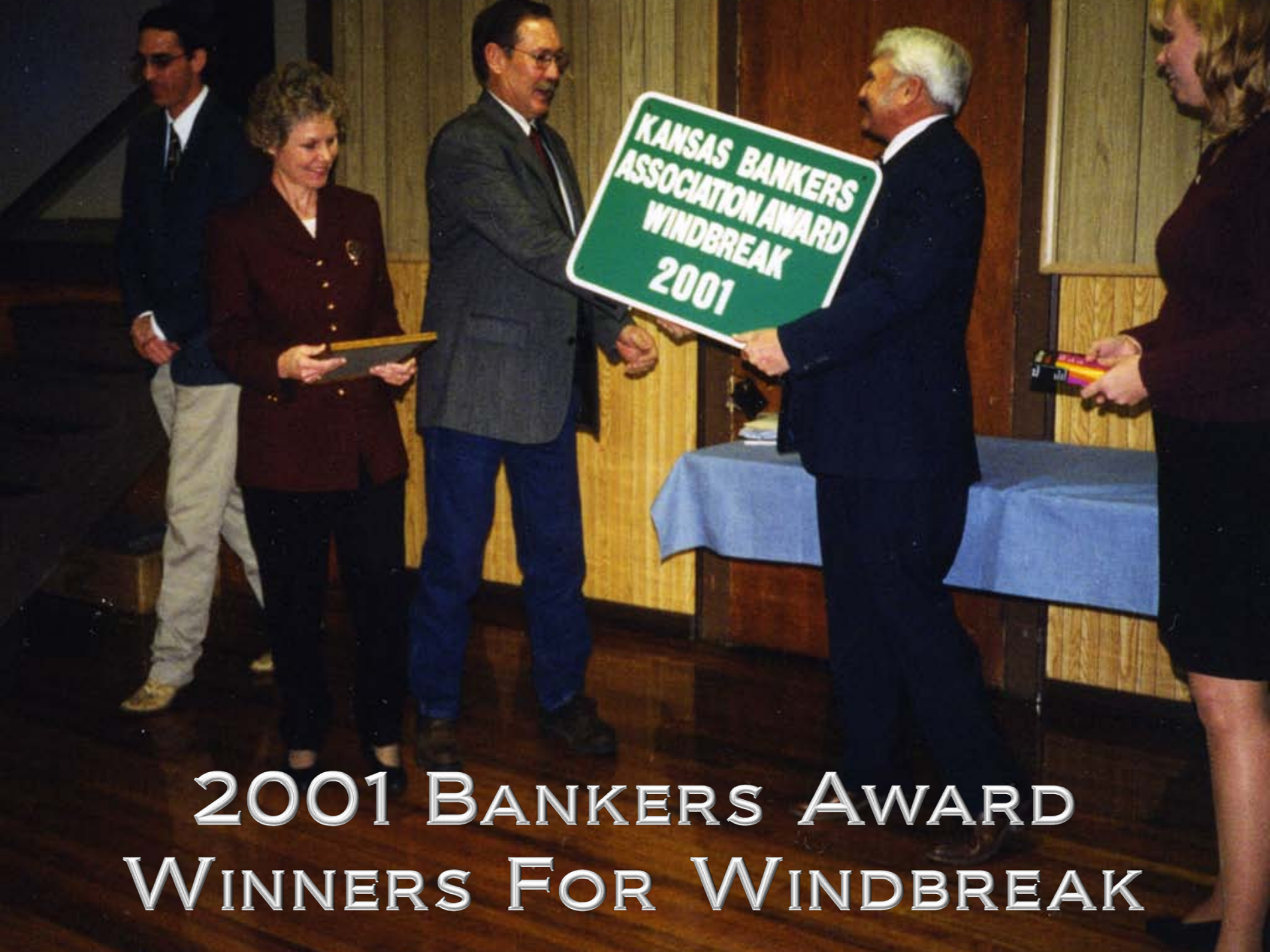
2001 BANKERS AWARD WINNERS FOR WINDBREAK