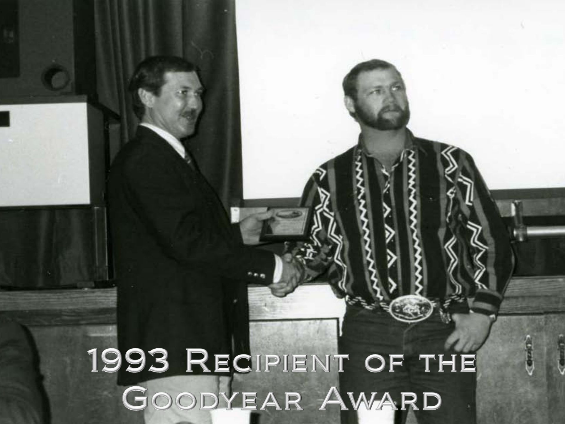
1993 RECIPIENT OF THE GOODYEAR AWARD